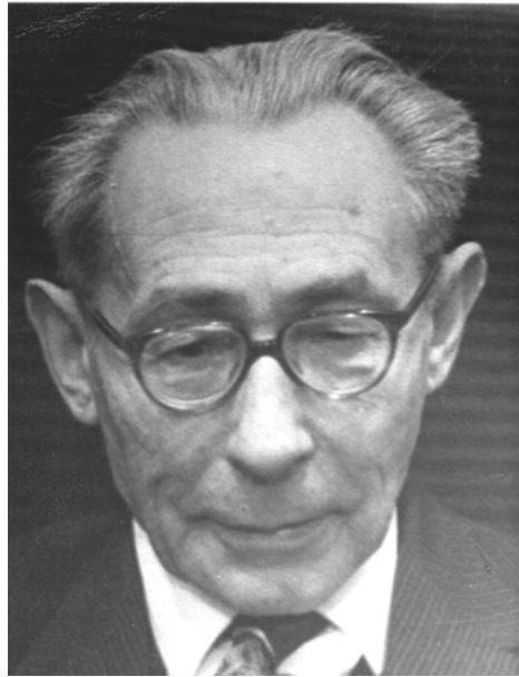
Hans Gál, 1962

He returned to Vienna, but, as a Jew, had to flee when the Nazis annexed Austria to the Third Reich in March 1938. He and his immediate family were able to escape to Britain, but it was not until after the Second World War, during which he suffered a period of internment as an 'enemy alien', that he finally obtained a permanent position as lecturer in the Department of Music at the University of Edinburgh and acquired British nationality.